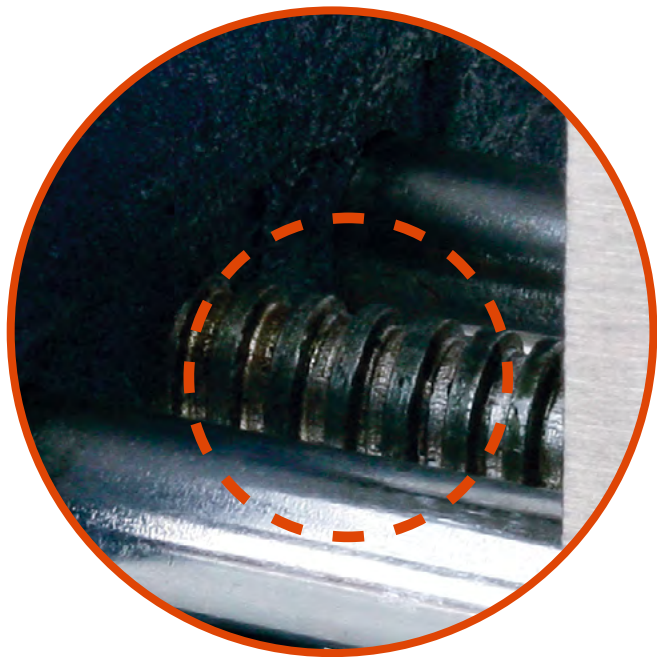
Steel Main Screw