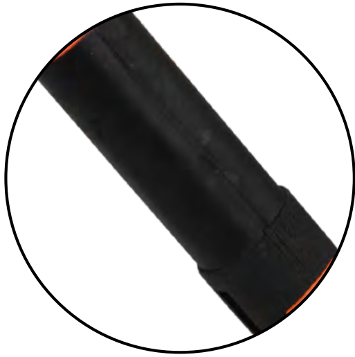
Handle Made of Quality Carbon Fiber