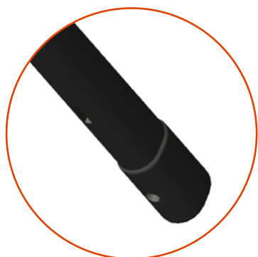
Ergonomic Rubber Grip Handle