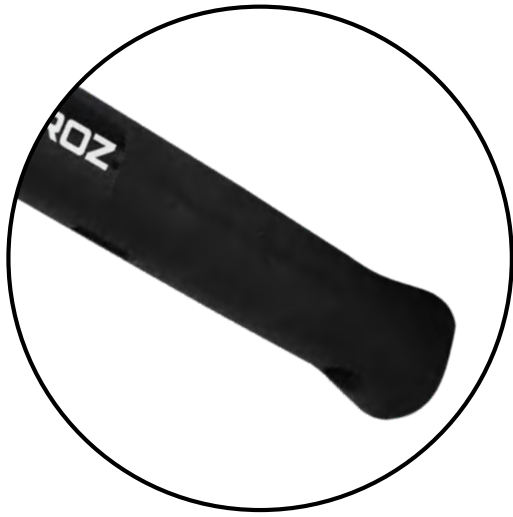
Grip Made of Quality Rubber