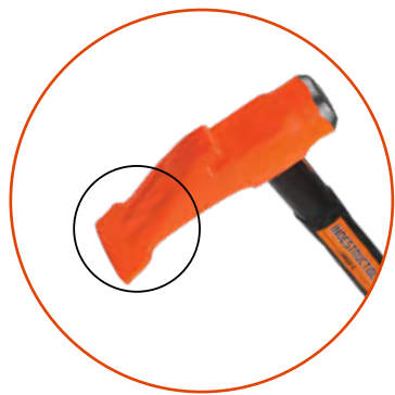
Bead breaking Wedge