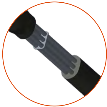
Spring Steel Bars