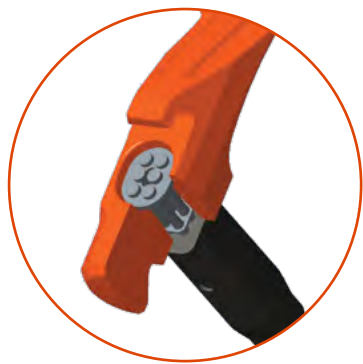
Spring Locking Plate