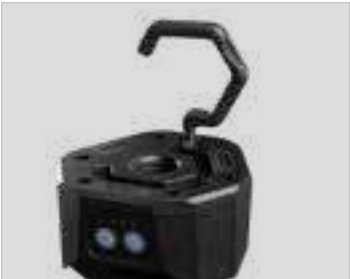
Nylon hook with 360° rotation

Adjustable blade design 270° rotating light folds back into a compact sitelamp & 180° pivoting action to direct light in the desired direction