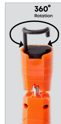
Rotating Hook with ratcheting mechanism