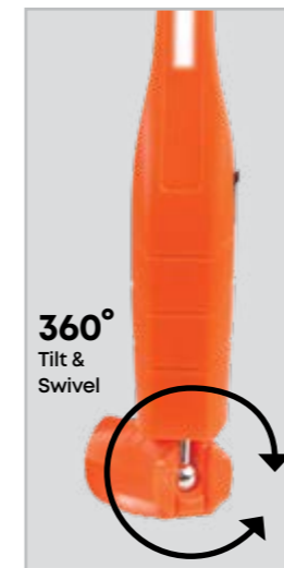
Patented 360° Swivel & tilt design with stainless steel joint