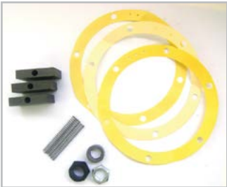
KIT/RBP/3V Includes pump head gasket, graphite vanes (3), Vane springs(3) Shaft nut, packing nut, paper washers (3), & rod guide